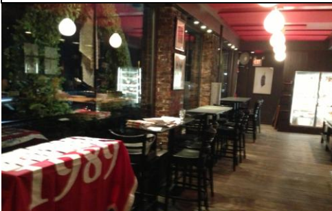
The Butcher Shop moments before it was taken over by the Class of 1989.